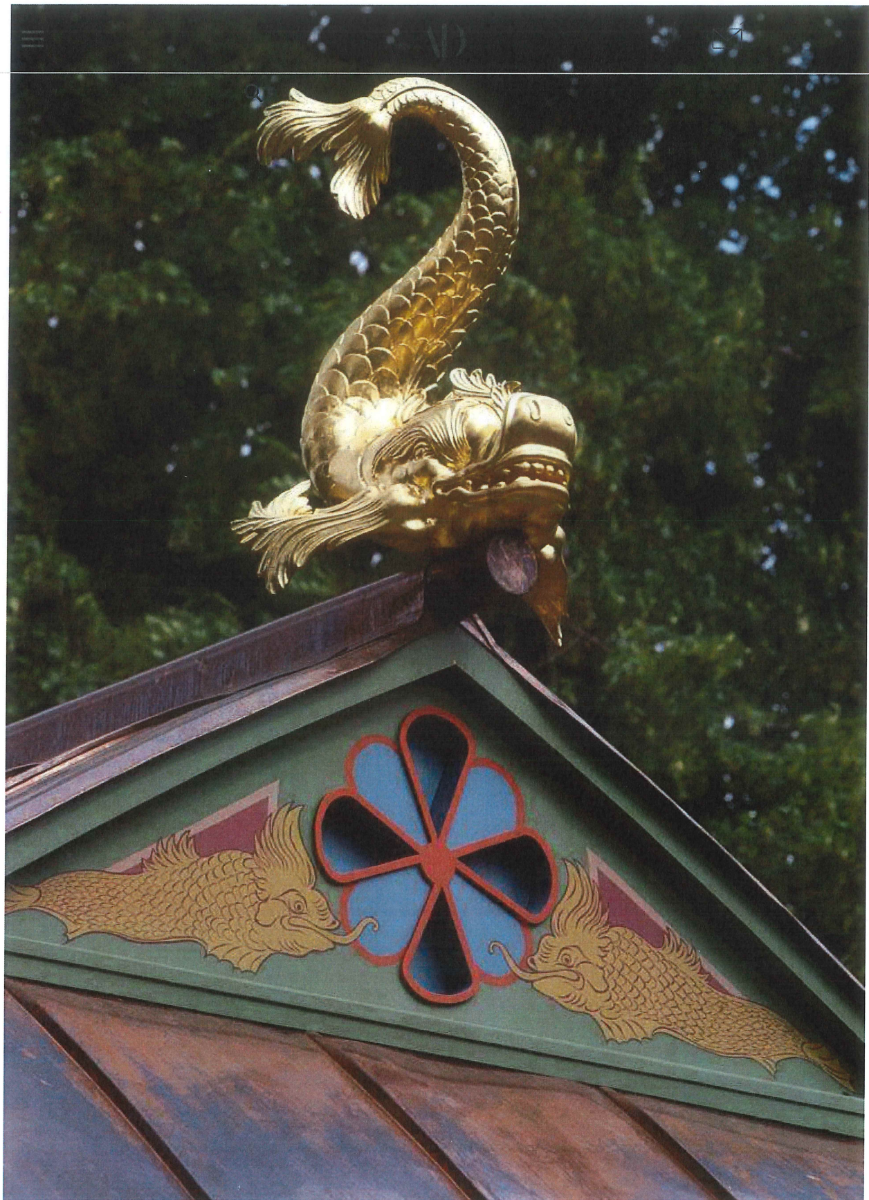
Detail of a gilded fish finial on the Chinese House.