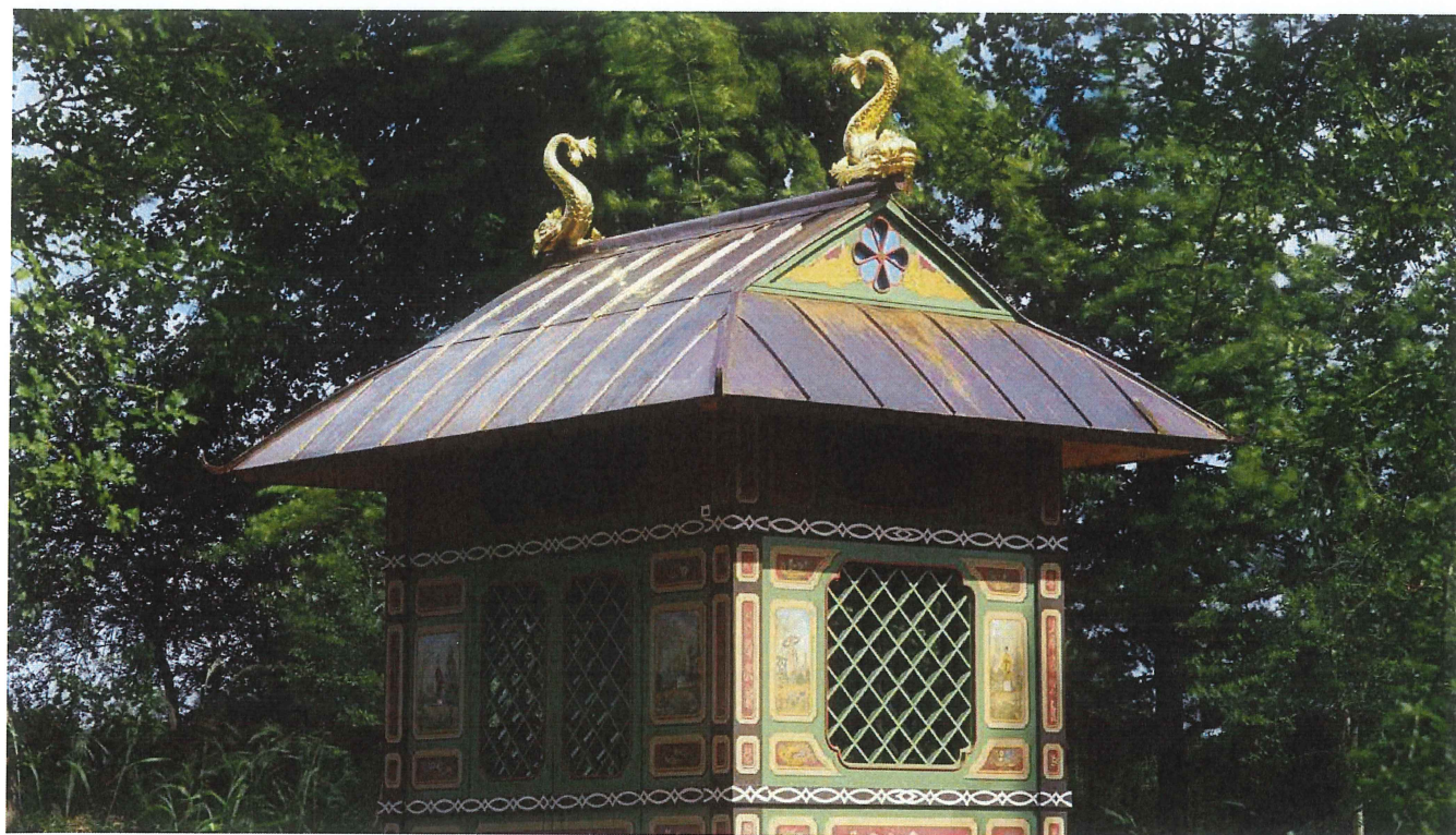
The Chinese House at Stowe, a garden pavilion attributed to William Kent and commissioned by Sir Richard Temple, Viscount Cobham.