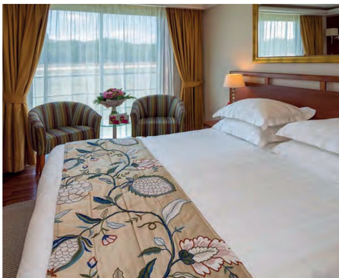
Dining room, (top) and Category A cabin, Violin Deck, AmaDante (above)