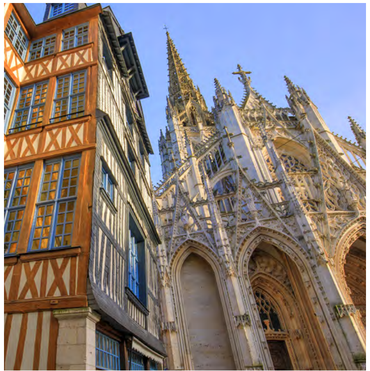
Church of Saint-Maclou, Rouen

Option 1: Travel to Étretat , where white-chalk cliffs rise nearly 300 feet above the sea. Here, you will explore Les Jardins d'Étretat , an avant-garde clifftop garden created by Monet's friend, the actress Madame Thébault. After lunch, join a guided painting workshop with a local artist to render the cliffs that once inspired Monet.