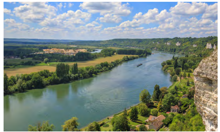
The Seine, Les Andelys