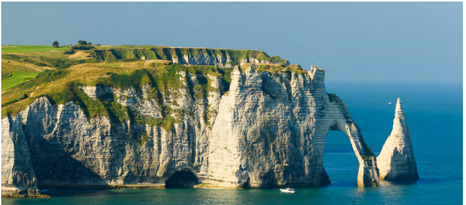
The Porte d'Aval, Cliffs of Étretat

Join an expert-led tour at the Musée des Beaux-Arts de Rouen , home to the second-largest Impressionist collection in France.