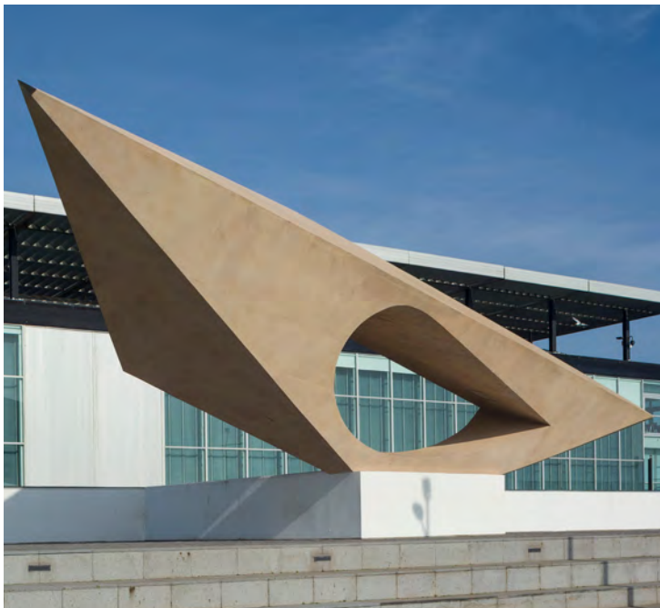
Henri-Georges Adam, The Signal , 1961, Musée d'art moderne André Malraux (MuMa), Le Havre

At sunrise from the Port of Le Havre , you may paint the scene Monet depicted in Impression, Sunrise . After breakfast, select one of three full-day excursions before returning for dinner and an onboard evening performance.