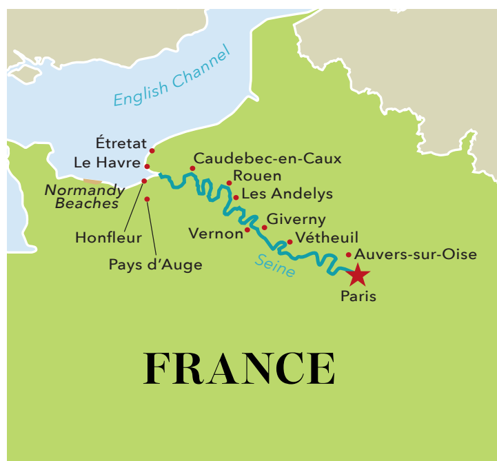
Map of the region

Return to the ship for lunch and an afternoon cruise toward Le Havre. You may gather on the sun deck for an optional introductory en plein air painting workshop . Learn the outdoor, quick-brush technique Monet used to capture the light on the Seine. Alternatively, a guided yoga and meditation session is available. B,L,D