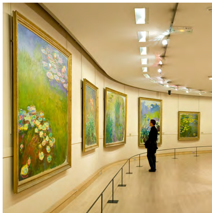
Musée Marmottan Monet, Paris

At the museum, see several of Monet's works whose inspirations we will later experience on the cruise, including Impression , Sunrise , the very painting that gave the Impressionist movement its title. The collection also includes Monet's Water Lilies series, the most comprehensive public collection of paintings by Berthe Morisot, and works by Degas, Manet, and Gauguin. Later, we will gather for the welcome reception and dinner this evening aboard AmaDante . L,R,D