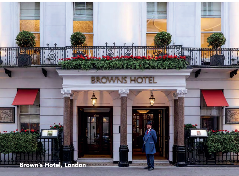
Brown's Hotel, London