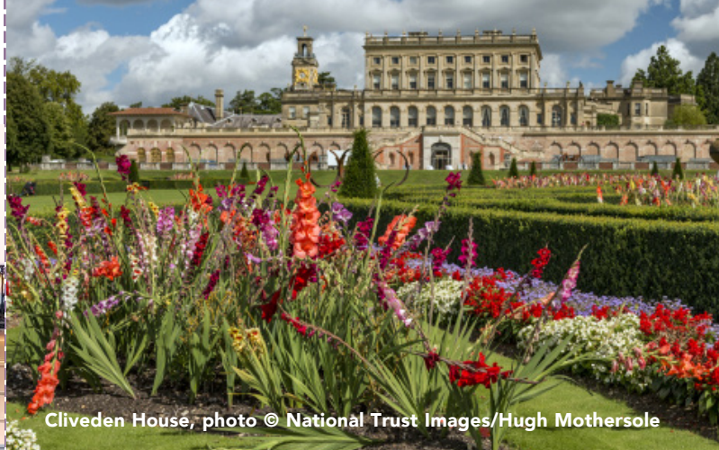
Cliveden House