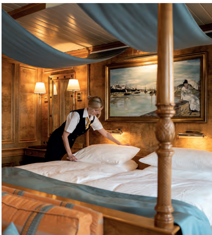
Sea Cloud II (top) and Owner's Suite (above)

Sea Cloud II is a three-masted sailing yacht steeped in the elegance of yesteryear and complemented with the most modern amenities. Sister ship of the legendary Sea Cloud , Sea Cloud II has 47 outside cabins and travels under 23 billowing sails trimmed by hand. From the mahogany-paneled library and gracious lounge to the gym and water sports platform, no detail has been overlooked. Praised by the world's most discerning travelers, Sea Cloud II receives consistently high rankings from Condé Nast Traveler . Passengers enjoy open seating at all meals and complimentary use of all water sports equipment. A doctor is on call 24 hours a day. Please note that there is no elevator on Sea Cloud II .