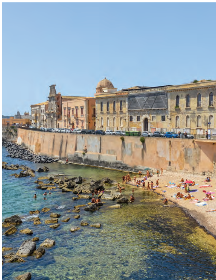
Ortygia Island, Sicily

Arrive in Catania, Sicily . After lunch, you will be transferred to the elegant, three-masted sailing yacht Sea Cloud II for embarkation. Enjoy a warm welcome on deck and a champagne toast as the vessel sets sail from the harbor. After settling in, gather for the captain's welcome reception and dinner. L,R,D