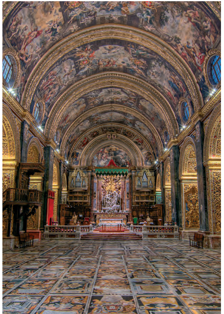
St. John's Co-Cathedral, Valletta, Malta

A guided tour of the 16th-century St. John's Co-Cathedral reveals an interior of High Baroque splendor, including a floor composed of nearly 400 inlaid marble tombstones. In the Oratory, view two Caravaggio masterpieces: The Beheading of Saint John the Baptist , his largest work and the only painting he ever signed, and Saint Jerome Writing .