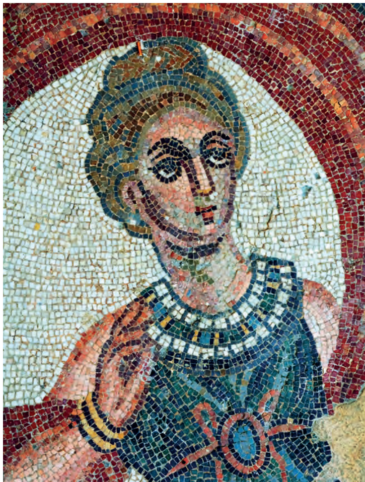
Villa Romana del Casale

Sea Cloud II arrives at Porto Empedocle , Sicily, where you may choose between two expert-guided excursions to UNESCO World Heritage Sites: