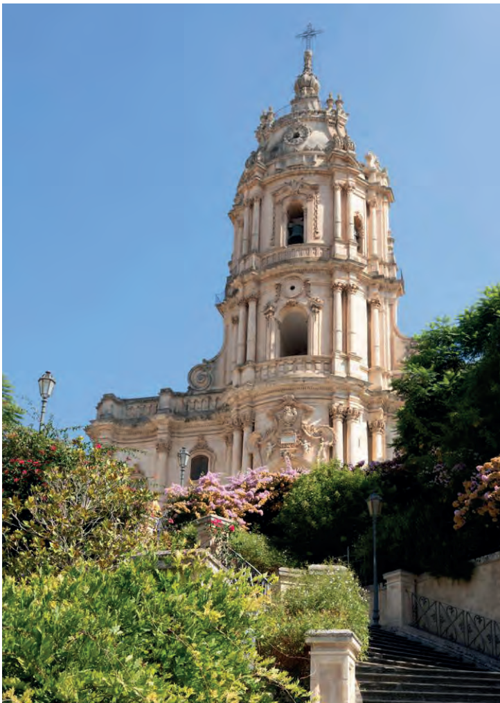
Cathedral of San Giorgio, Modica

Founded by the Knights of St. John in 1566, Valletta is the only national capital UNESCO has recognized in its entirety, boasting one of the world's densest concentrations of historic treasures.