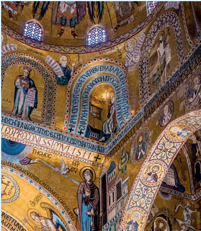
Cappella Palatina, Palermo

Extend your journey in Palermo , a city where Norman, Arab, and Byzantine cultures converged to create a brilliant architectural and artistic synthesis. Explore the city's UNESCO-listed sites, including Europe's oldest royal residence, the Palazzo dei Normanni . Inside, see the Cappella Palatina , with its glittering Byzantine mosaics and a spectacular Islamic muqarnas ceiling. At the nearby Cattedrale di Monreale , you will stand beneath the world's largest cycle of Byzantine mosaics. The program also includes a look at the Sicilian Baroque, with the intricate stucco work of Giacomo Serpotta at the Oratorio di Santa Cita , and a private visit to a historic palazzo , deepening your encounter with Sicily's multifaceted heritage.