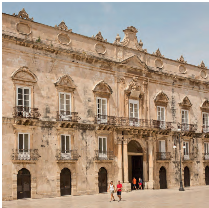
Palazzo Beneventano del Bosco, Sicily