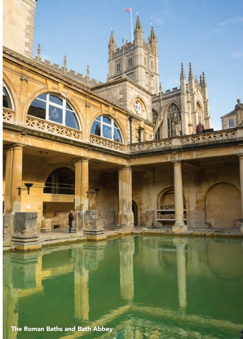
The Roman Baths and Bath Abbey