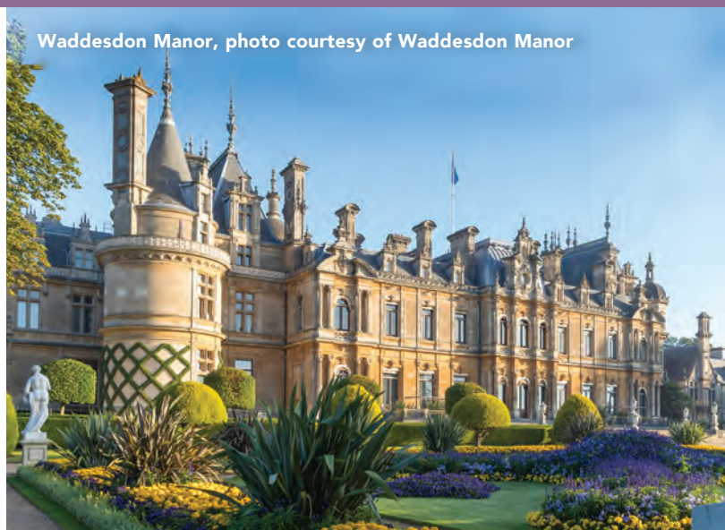
Waddesdon Manor