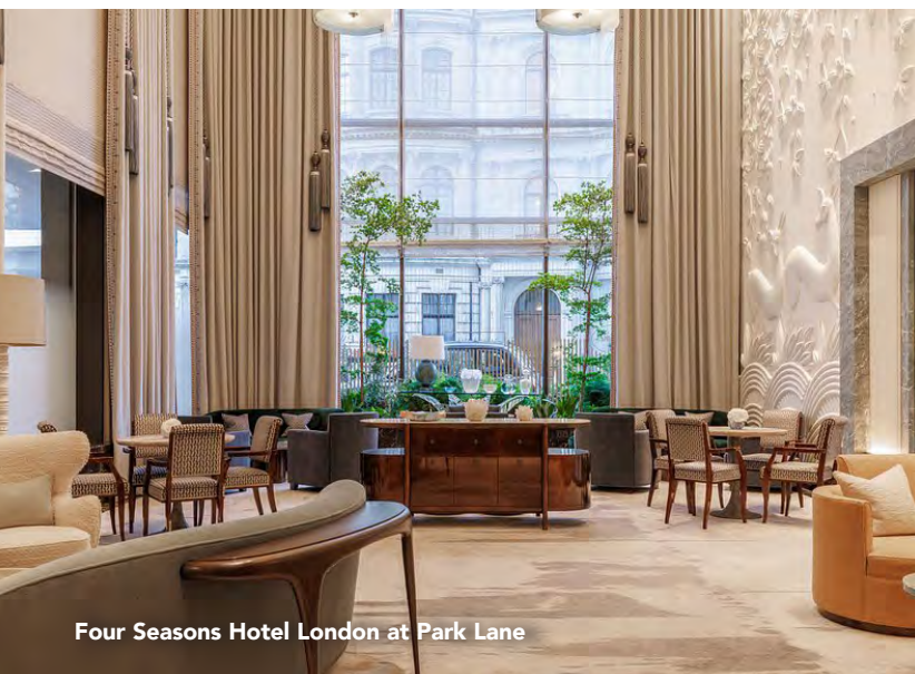
Four Seasons Hotel London at Park Lane