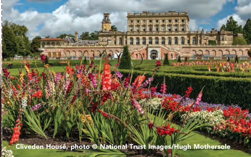
Cliveden House, photo © National Trust Images/Hugh Mothersole